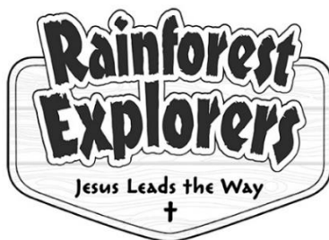
Register for Snacks/Crafts