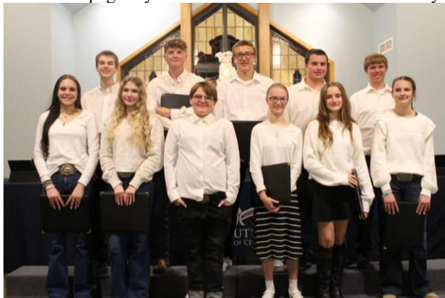
Students involved in the music programs at FLHS.

The students gave a marvelous performance at Faith at Christmas this past week as we celebrated the birth of our Savior. We were incredibly blessed to give this performance to those in attendance and those viewing from home. The video of the program can still be found on our Facebook page if you were unable to watch it on Tuesday.